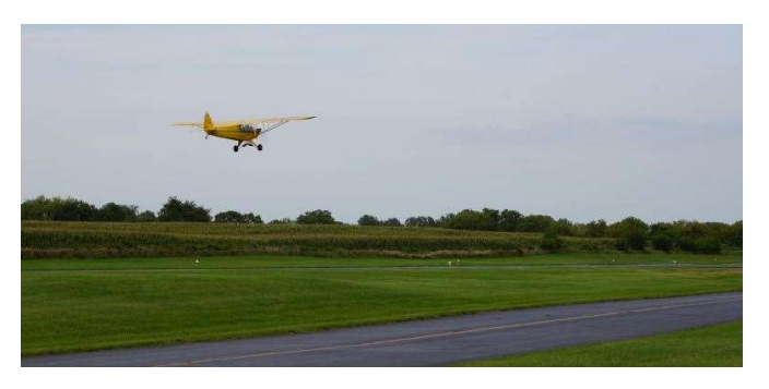
Away he goes!