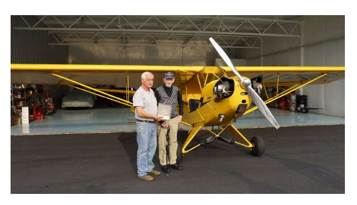
Back on the ground at the hanger