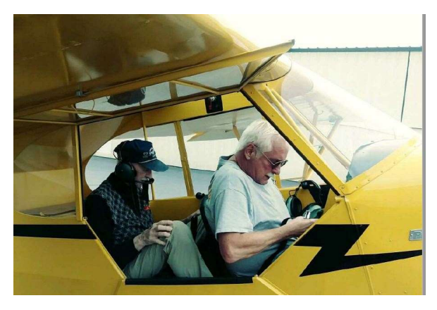
Reviewing the check list