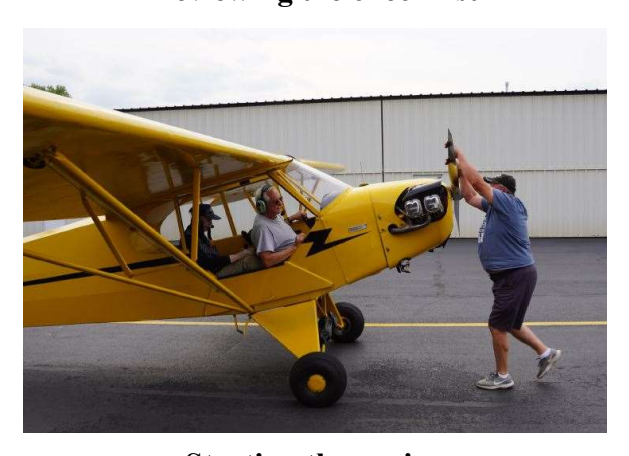
Starting the engine