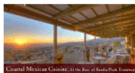
Coastal Mexican Cuisine, at the base of Sandia Peak Tramway