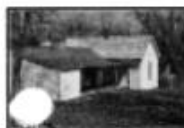
Jesse James Farm

This was the largest single discovery of artifacts from the time of the early frontier, a time capsule that all should be able to see, and learn from. None of the items were sold, instead creating a wonderful museum housing the artifacts for all to enjoy."