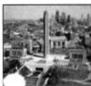
World War I Museum

The National World War I Museum is a world-class historical collection and exhibition which focuses its attention in the areas of exhibition, education, research and interpretation.