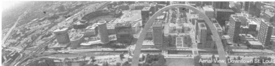
Aerial View, Downtown St. Louis

Gateway To the West to be Explored by 483 rd Bomb Group