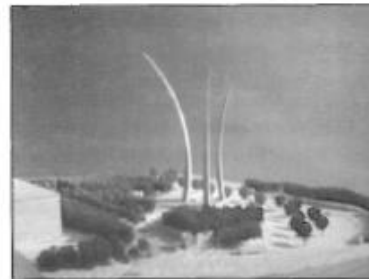
Air Force Memorial - Washington DC

The PX is a big undertaking. It's something to look forward to. The entire operation and inventory is programmed at least two years ahead. We add items to keep up interest and to involve new members as well as old times. Check the PX List to see what's new. We plan to unpack on Sunday, October 14 and get everything ready to set up. We will be open for business Monday, the 15 th . Come in early and get your Secret Number! We will have a surprise for the A.M. and one for the P.M. The 483 rd PX is one of our best messengers to put out the word about the 483 rd and to keep the Association alive.